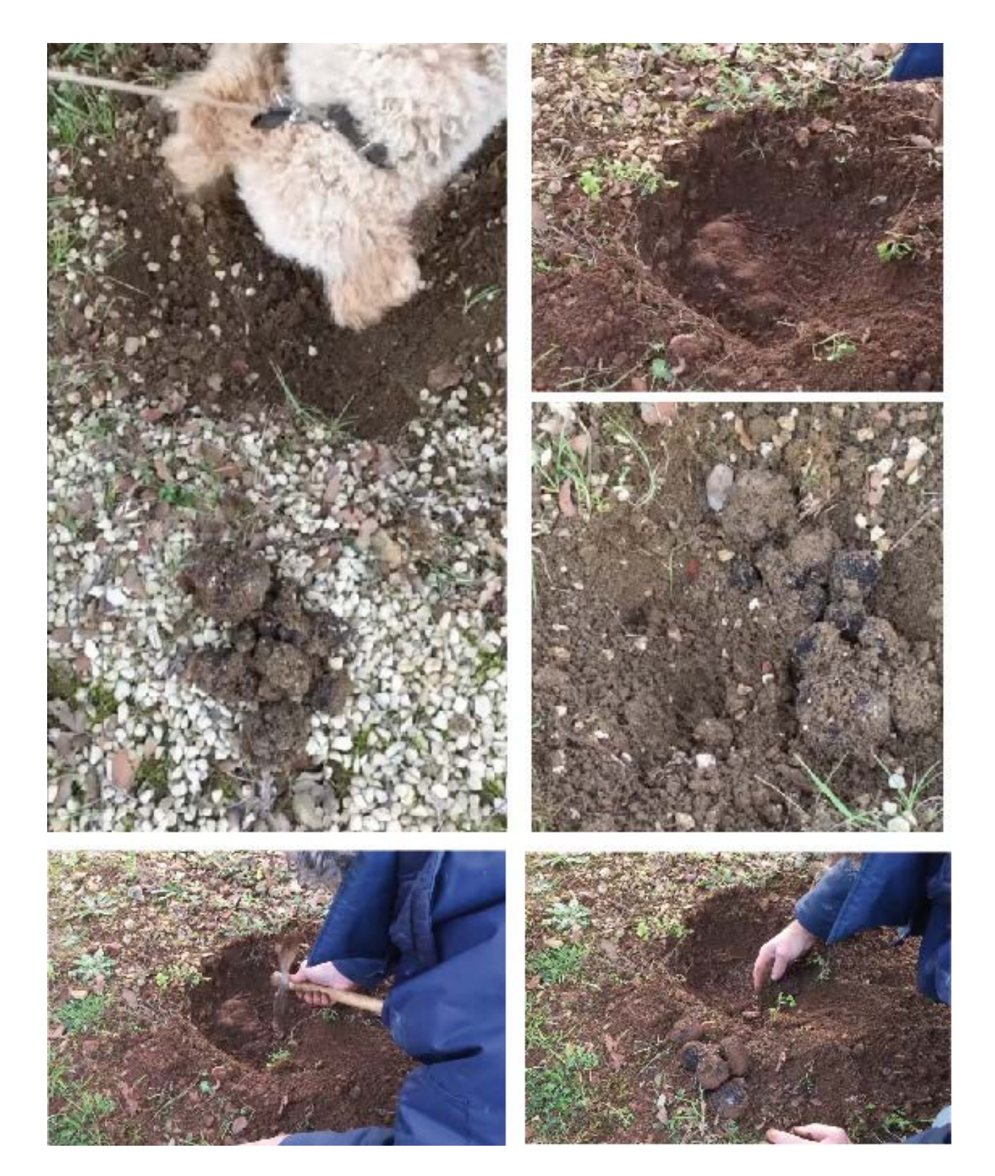
Fig. 2. Pictures showing the truffles harvested in holes Fig. 2. Immagini che mostrano la raccolta dei tartufi nei pozzetti